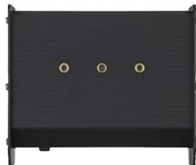
Three Threaded Mounting Holes (1 @ 1/4 - 20, 2 @ M5 on underside)