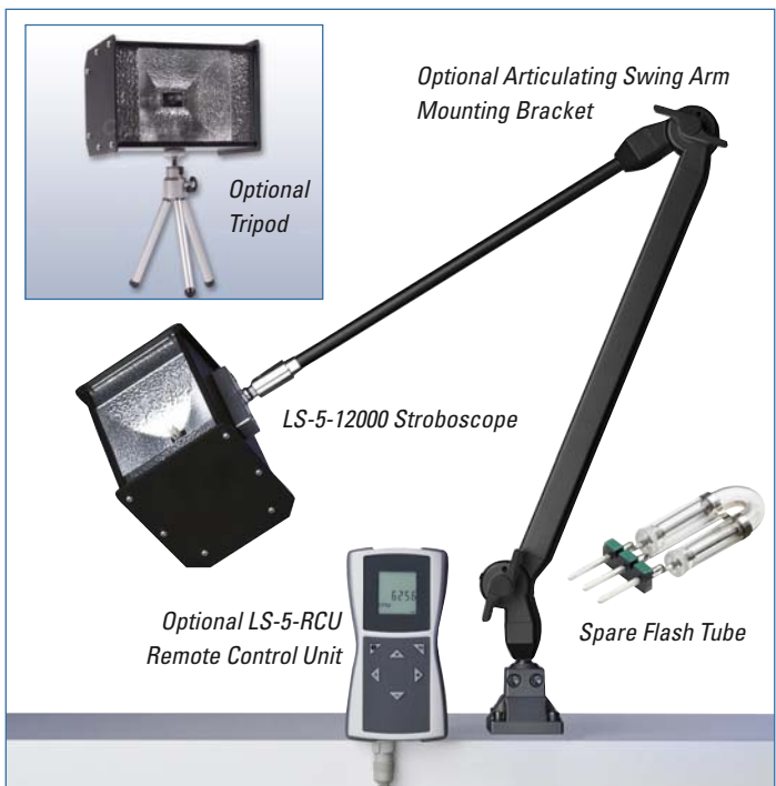
Optional Articulating Swing Arm Mounting Bracket