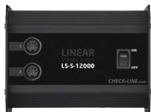
Control Panel with input/output ports