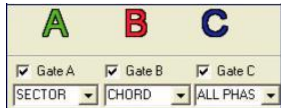
Three gates may be set, based on All Phase, Sector, Chord, or Half Chord Thresholds.