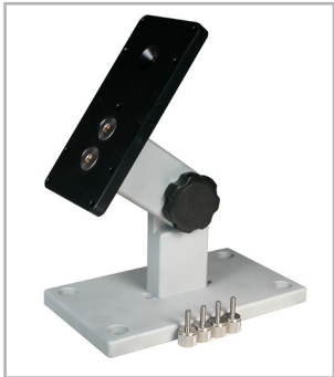
^ Optional AC1008 tabletop mounting stand