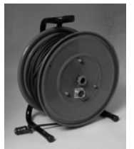
Extension detector cable