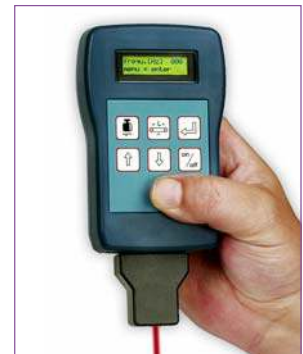
Plug-in type sensor allows one-handed operation