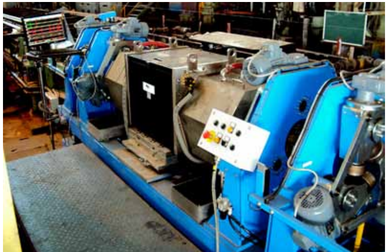
Ultrasonic Rotary on Triple Guide Roll Test Bench

MAC's Rotoflux® flux leakage test systems accurately detect longitudinal and transverse OD and ID defects as small as 5% of the wall in annealed heavy wall magnetic tubular products including oil country tubular goods to meet API specifications. In line seam annealing makes physical properties more uniform and allows for precise test results. Recent MAC systems have featured 24 channels for longitudinal defect detection and 48 for transverse defect detection.