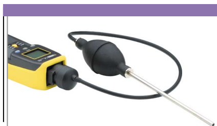
Gas extraction kit with pump and connector