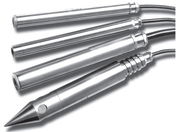
Model PWS, PWC, PWF and PWP

The PWC is provided with a pipe thread adapter, thus enabling the piezometer to be used as a pressure transducer.