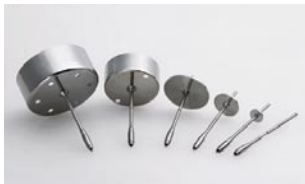
[Rotor Upper Limit Value] (Unit:mPa · s)

Select according to desired measurement range