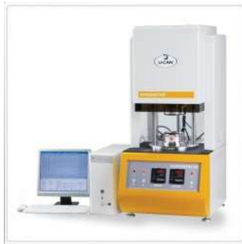
Special designed rheometer for silicon rubber testing.