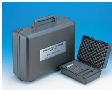
Viscometer Storage case