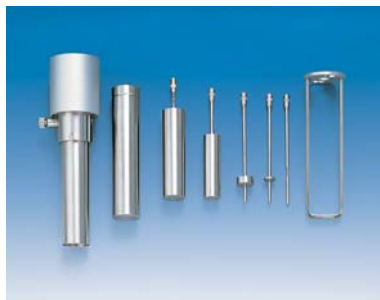
M Rotor set + BL Adaptor