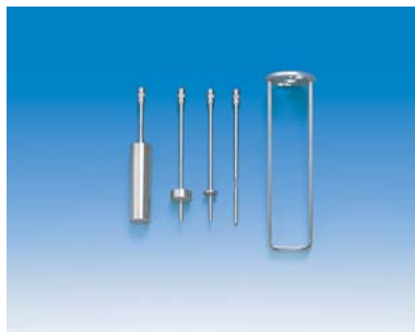
M Rotor set