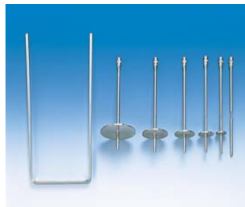
H Rotor set