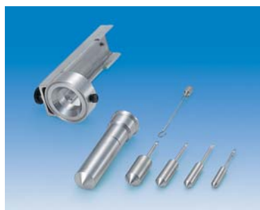
Small sample adaptor

Mounts on various rotational viscometers. Suitable for small volume sample measurement of a wide range of viscosities including gel substances.